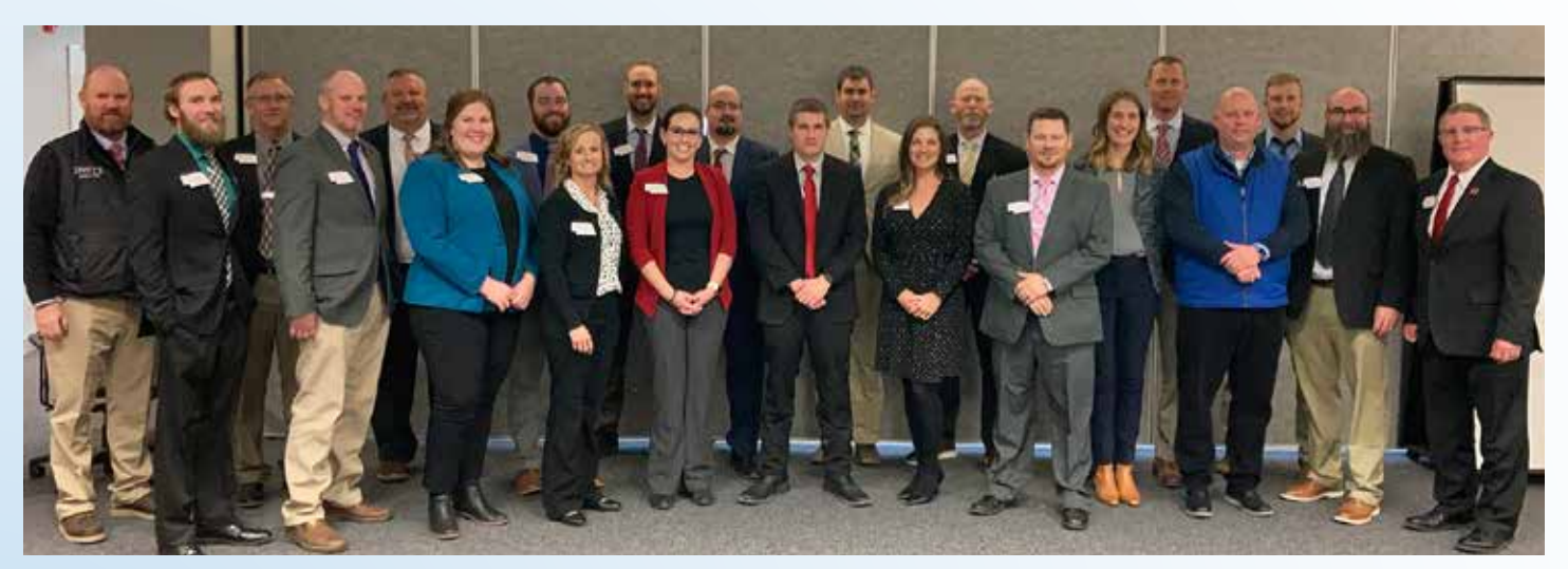
LEAD 39 includes ag professionals from cities all over Nebraska including Broken Bow, Elgin, Grand Island, Lincoln, Mullen, Omaha, and many more.

Twenty members of the 39th Nebraska LEAD program recently visited AGP corporate headquarters in Omaha, NE as part of their two-year educational requirement. LEAD is coordinated by the University of Nebraska-Lincoln and stands for Leadership Education/Action Development. All LEAD participants are Nebraska residents involved in production agriculture, agribusiness, or a related field.