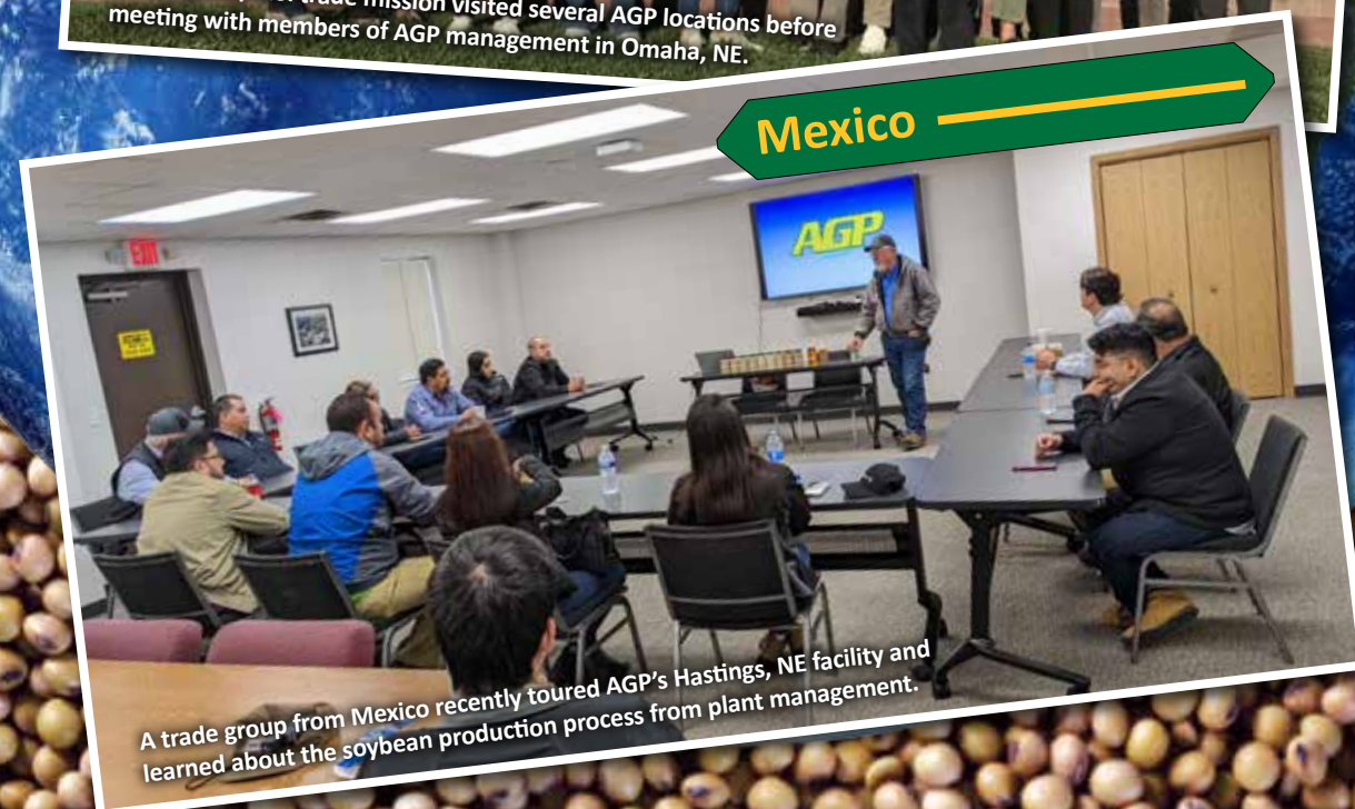
A trade group from Mexico recently toured AGP's Hastings, NE facility and learned about the soybean production process from plant management.