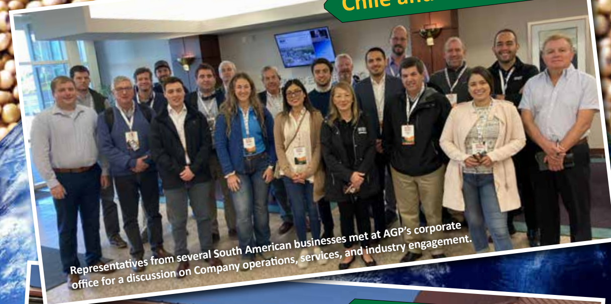
Representatives from several South American businesses met at AGP's corporate office for a discussion on Company operations, services, and industry engagement.