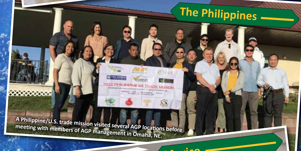
A Philippine/U.S. trade mission visited several AGP locations before meeting with members of AGP management in Omaha, NE.